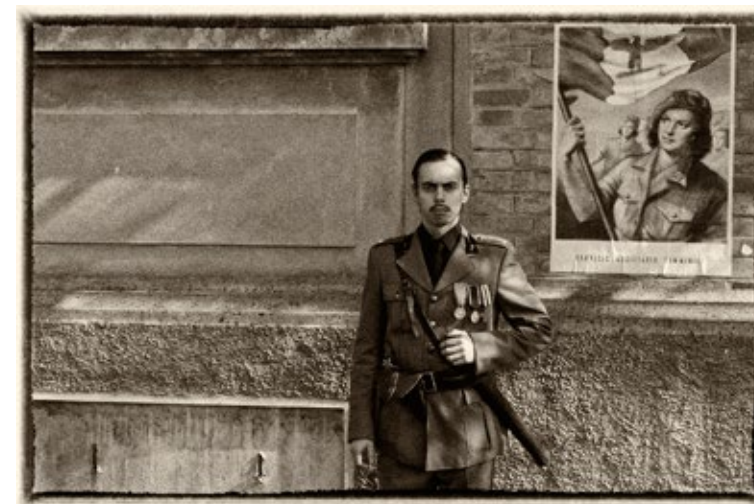
The leader of the local fascists. La fiera di San Martino (in game).

So in 2015, it was 70 years since the liberation from Nazis and fascism. Time flies away, and more and more witnesses of those times are passing away. There is a risk that after no survivors are left, April 25 will become a mere institutional celebration: just a number on the calendar without signifi-